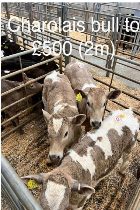
Charolais bull to £500 (2m)