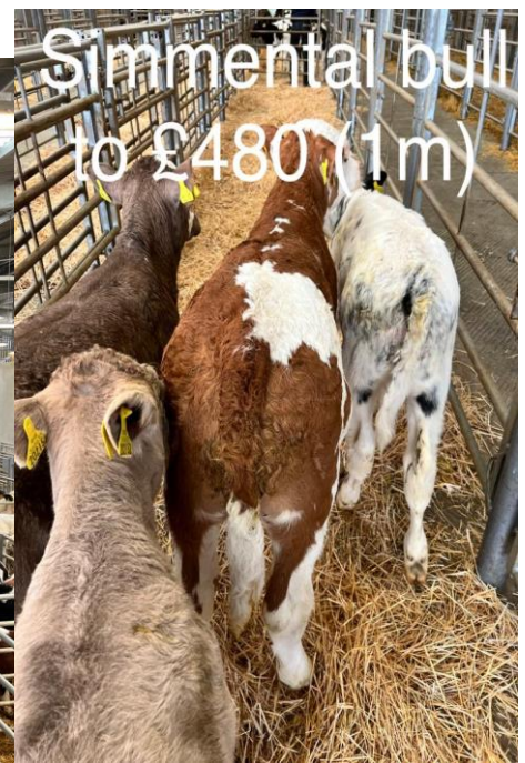
Simmental bull to £480 (1m)

245 Calves forward sold to an outstanding trade topping at a South West high of £500 for a phenomenal Charolais in from WS Jose & Son of North Tamerton